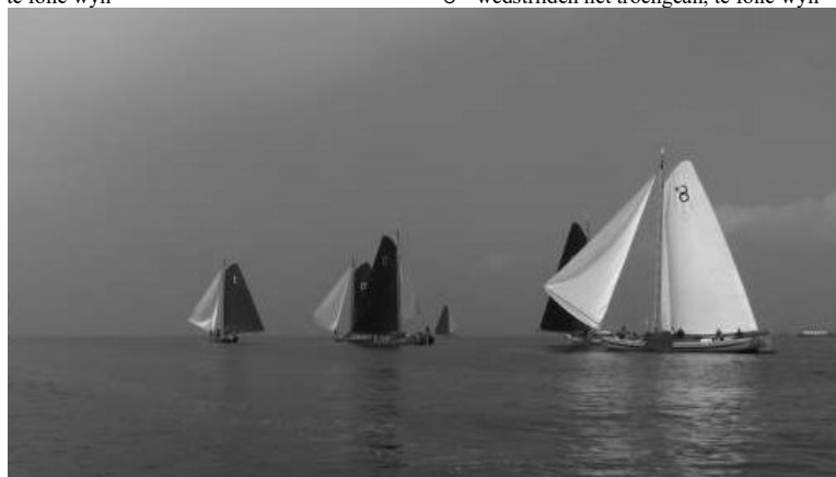
Weinig wyn yn 2007, dernei twa jier te folle.